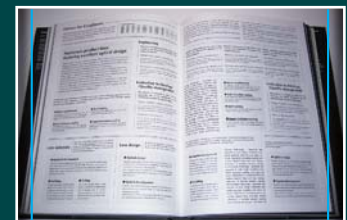
Customized SeeMax Power